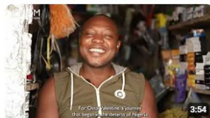
Renaissance in Agbara - Ossai's Story of Return to Nigeria 13 views • 3 months ago